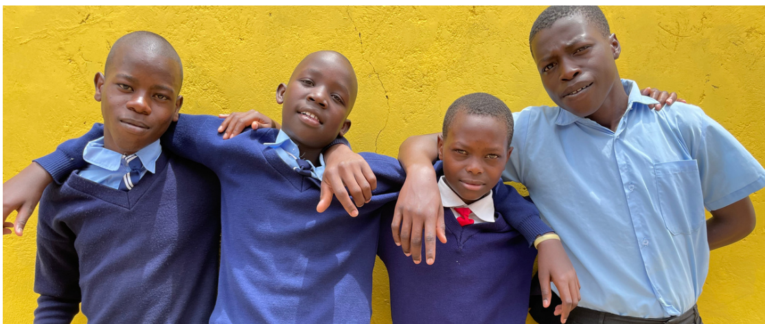
The children who sat for the KCPE Examination 2023